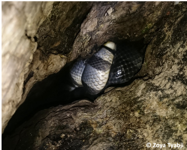
Image 2. Record of nesting by Laticauda colubrina at New Wandoor Beach, South Andaman Island, where an egg is partially covered by the gravid female's coiled form.

on the trunk and root of the uprooted tree, the sea krait disappeared into a crevice. A conspecific male was observed following the path the female had taken. The male was seen to be repeatedly tongue-flicking while following the path. Once near the crevice, it circled the area and entered another crevice, close to where the female had entered.