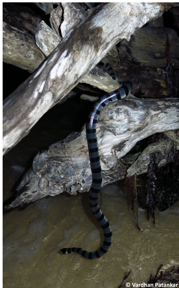
Image 1. Laticauda colubrina on an uprooted littoral tree at New Wandoor Beach, South Andaman Island.