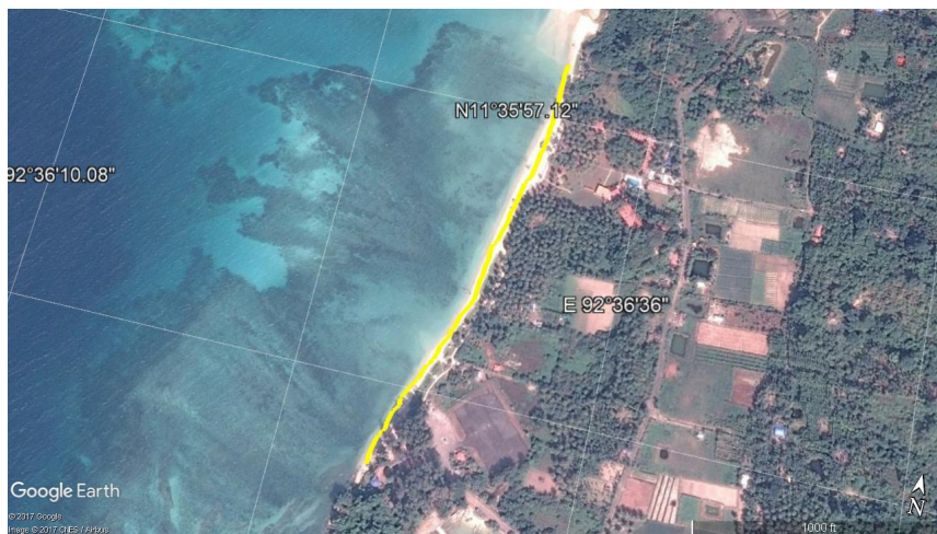
Figure 1b. Transect sampled at the New Wandoor Beach for the study