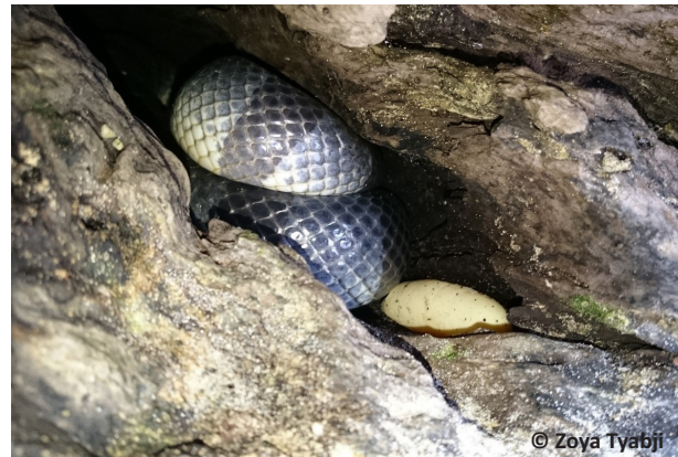
Image 3. Record of the exposed egg of Laticauda colubrina at New Wandoor Beach, South Andaman Island.

This study provides long-term data on the number of encounters, habitat use, and behaviour of sea kraits. The encounters of L. colubrina was found to be 20 times higher than that of L. laticaudata , similar to the findings on South Reef Island (Bhaskar 1996). This rarity in abundance likely contributes to the fragmented distribution of L. laticaudata . Both the rate of cutaneous evaporative water loss and the extent of terrestrial dependence are known to differ among the sea krait species with L. colubrina having relatively higher dehydration rates in seawater (Brischoux et al. 2012), lower rate of cutaneous evaporative water loss, and higher dependence on the terrestrial habitat, and with L. laticaudata showing intermediate levels of water loss and terrestrial dependence (Liu et al. 2012). Laticauda laticaudata are known to utilize shelters almost exclusively under mobile beach rocks, which are both easily accessible from the sea and regularly submerged at high tide (Bonnet et al. 2009). In contrast, L. colubrina frequently travel long distances overland, with males moving significantly further from the beach