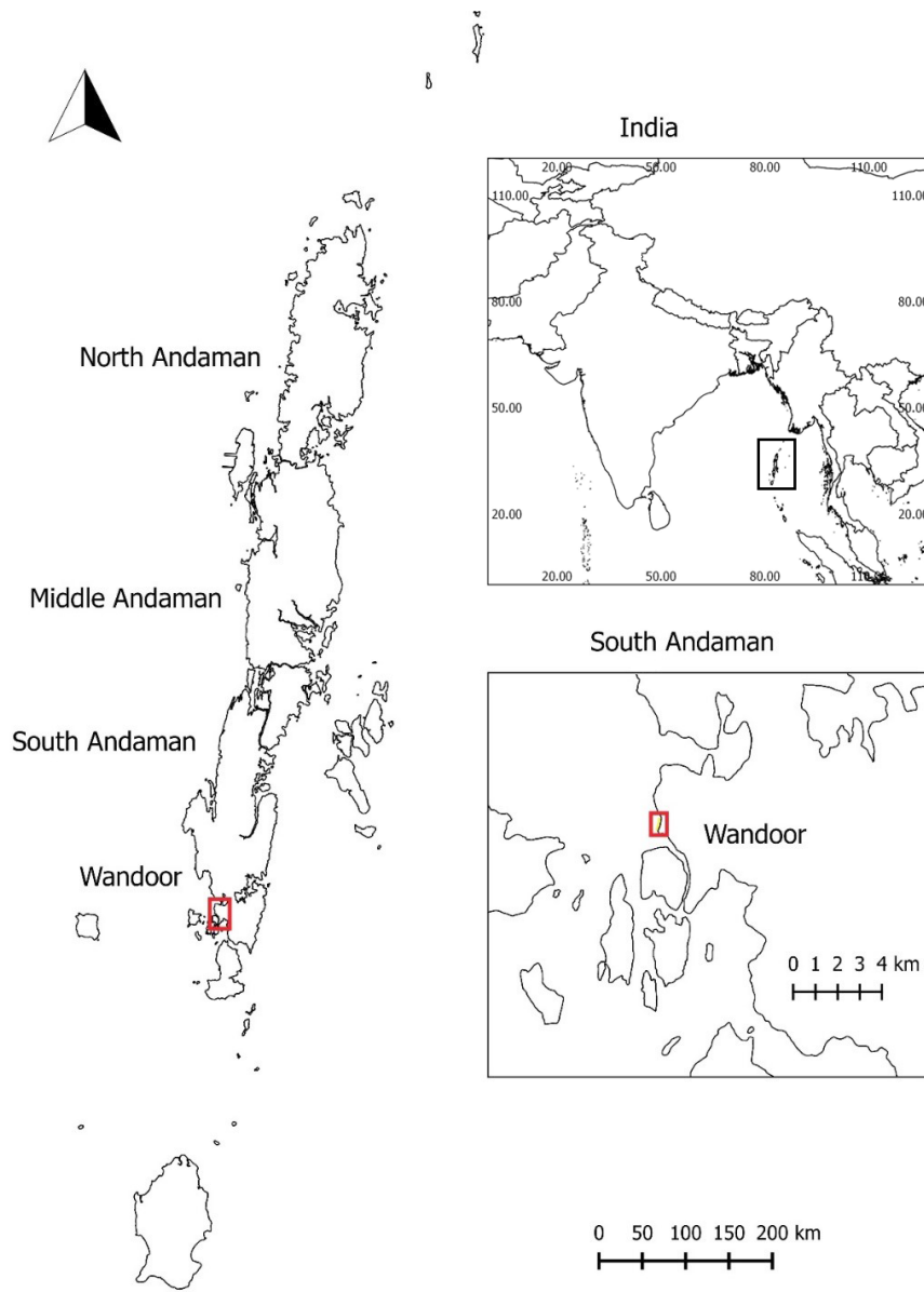
Figure 1a. Study area map showing the Andaman Islands. Inset top - the location of Andaman & Nicobar Islands in India, inset bottom - the location of the study area at the New Wandoor Beach, South Andaman Island