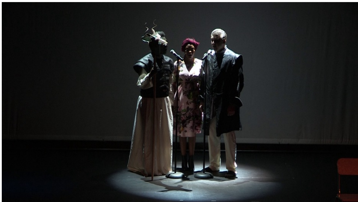
Figure 2: 'Little Lamb' performed by members of the Ghost Chorus. 2017.

The Lamb , composed by John Tavener in 1985 (refer to the music link at the start of this section, p98), is based on William Blake's poem by the same name, published in 1794, as part of the poet's series of works entitled Songs of Innocence and Experience (Snoddgrass, 2008: 40-48). Tavener, who is perceived by some as one of the most prolific composers of religious music, both in "Britain and indeed, in the world" (Hazlewood & Barley, 2014), is renowned for works such as The Whale (1966); Hymn to the Mother of God (1985); The Lamb (1985); The