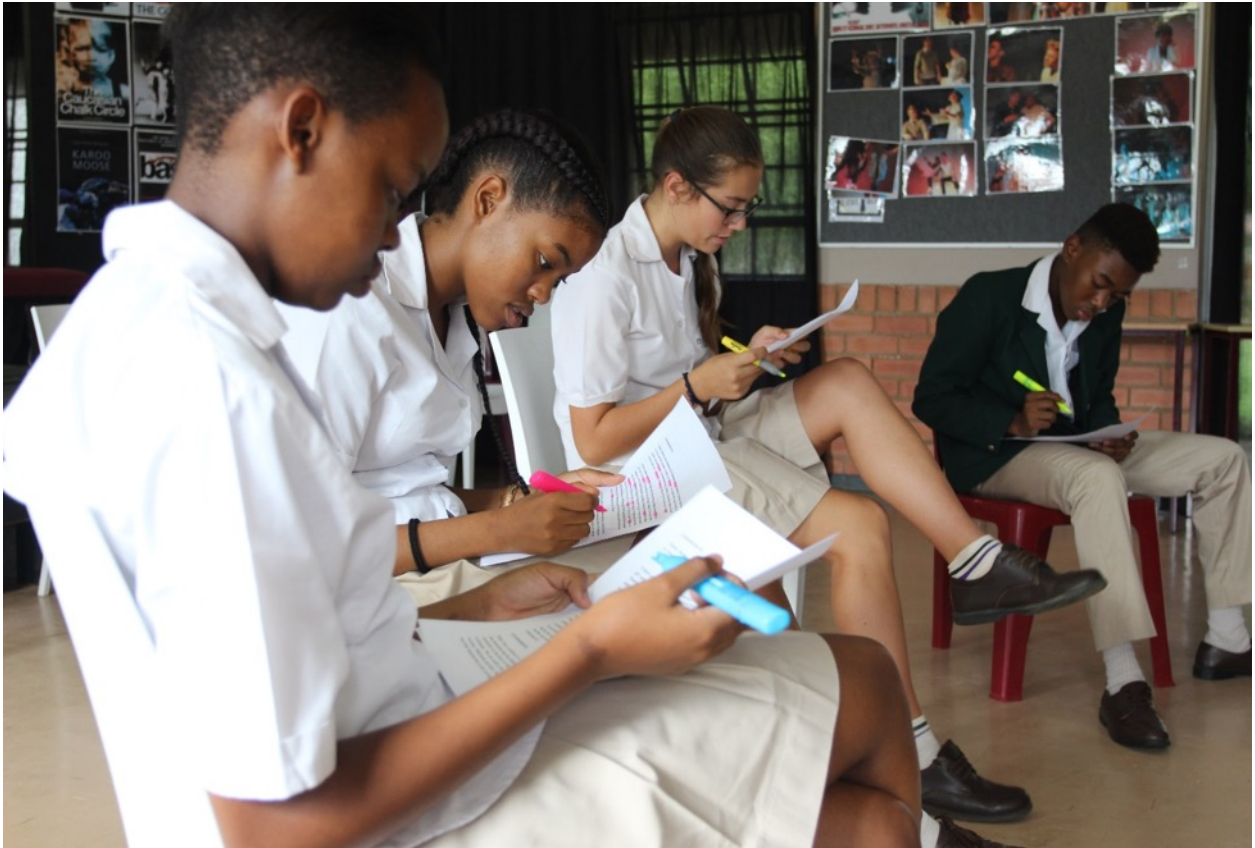
Figure 2: Members of the cast and backstage crew involved in initial discussions.