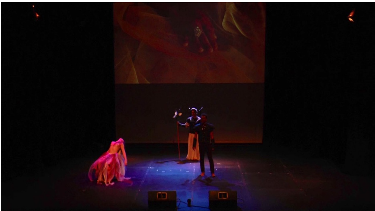
Figure 30: A dancing body and a virtual body performing the character of the bride. ( Missing , Scene 11). Photograph by Jaco van Wyk. 2017.

who is now shown to wear the same dress of colourful tulle, continues to play out her narrative in the guise of the young bride . She is now seated in a chair. As before, the fractured scenography facilitates narrative and temporal leaps by the introduction of an additional scenographic element - the messenger; and by readjustments of the existing texts - the dancer performs gestures that are similar but she has turned her chair away from the action to directly face the audience, and the audience's inability to definitively identify the close-up of the young woman on screen as the young bride . Gieseckam contends that the utilisation of scenographic elements in this way brings about a shift in scenic location as it transports the spectator from one fictional scene to another fictional scene, in a way similar to conventional scene-changes or displaced diegetic inserts in cinema (Gieseckam, 2007:30).