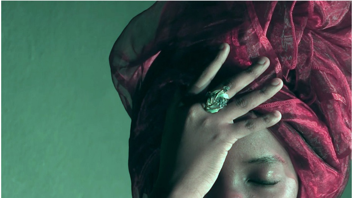
Figure 27: Mabuda's bride. ( Missing , Scene 11). 2017.