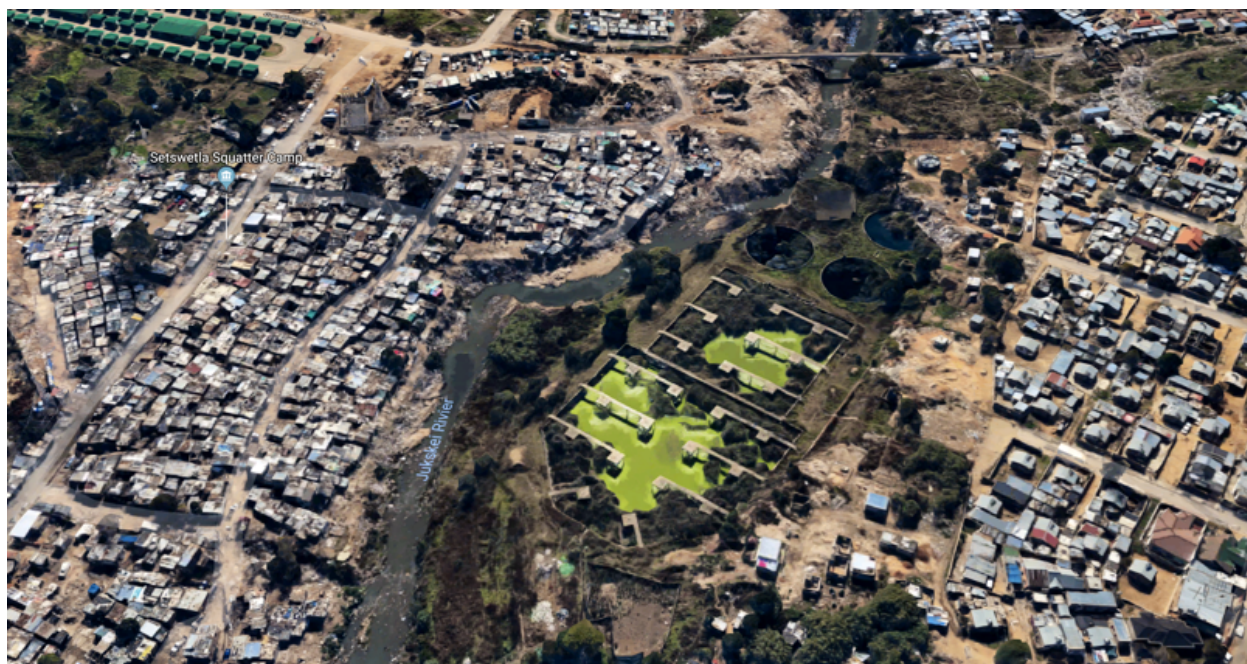
Figure 1: Aerial view of Setswetla situated on the banks of the Jukskei River.

assume culpability for the disastrous aftermath, ensued. Ekurhuleni 14 municipal councillor Jill Humphreys blamed it on the lack of foresight and inefficient stormwater clearance by the Roads and Stormwater department: “how could they not know?...the rainy season is upon us and every stormwater drain is blocked”. City spokesman Themba Gadebe, defending the city’s regular maintenance of drainage systems, blamed the magnitude of the storm, stating that it is “inevitable that the drain systems will be blocked when there is heavy rain [...] because rain