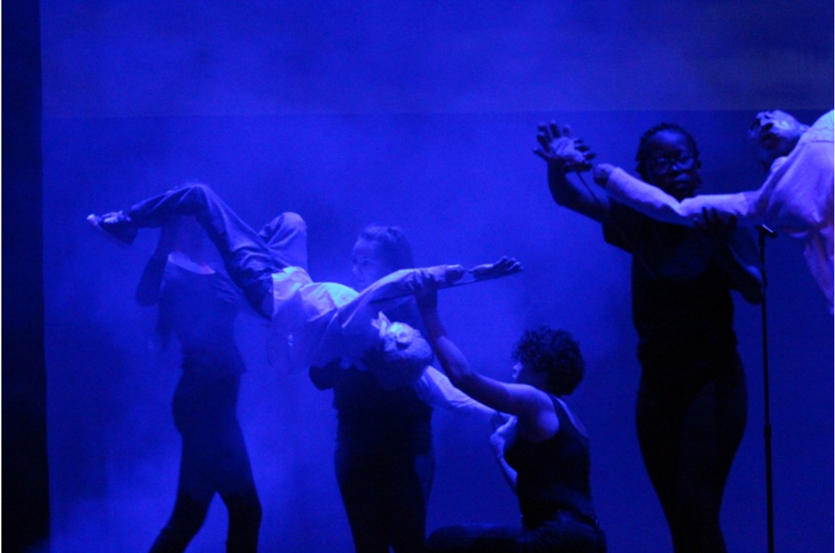
Figure 21: Our puppets simulating the drowning of Iziengbe’s children in the flood. ( Missing , Scene 16). Photograph by Jaco van Wyk. 2017.

My search for plausible explanations for how the imitation of human action by ‘inanimate objects’ crafted from light wood, paper and glue could evoke overtly emotional responses from spectators directed me towards literature on kinaesthetic empathy. According to American psychologist James Jerome Gibson, with reference to the kinaesthetic dimension of vision: “eyes should not be thought of as ‘cameras’ but as ‘apparatus for detecting the variables of contour, texture, spectral composition and transformation in light’” (in McKinney, 2013:8). Following on Gibson, Joslin McKinney 90 suggests that “the effects produced by spectacle are registered in the viewer’s whole body” and maintains that “these sensations are orchestrated by kinaesthesia 91 ” (McKinney, 2013:8). Dance critic John Martin’s postulations on ‘kinaesthetic sympathy’ in relation to the ‘muscular and emotional experiences’ and ‘responses’ of spectators when ‘watching dancing bodies’, which have also come to encompass other “interactive” cultural/aesthetic areas such as cinema and theatre, seem to centralise the