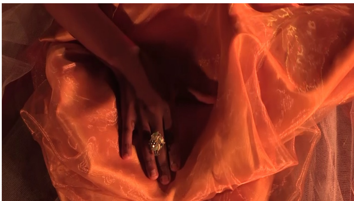
Figure 29: A wedding gift. ( Missing , Scene 11). 2017.

My directorial intention was to intimate an intertextual significance of the stage/screen relation. I optimistically hoped that the simultaneous existence of both texts within the same scenographic environment would facilitate the agency for mutual and interchangeable commentary. In this regard, Gieseckam's postulation, that the "simultaneous [...] presentation of various sources" demands "an alert spectatorship ready to read the relationships between different types of material or presentation" (Gieseckam, 2007: 258), seems plausible.