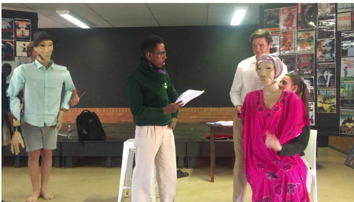
Figure 18: The Puppet Chorus in rehearsal.