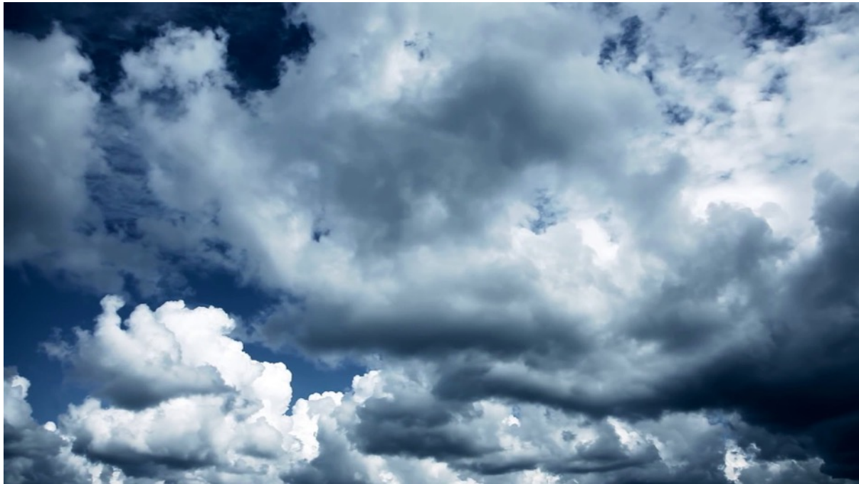
Figure 24: Still image from video depicting clouds in various scenes in Missing . Captured from video by Freemediabank. 2010. [Online]. Available: https://youtu.be/YgmlibSnZs [2017, June 3].