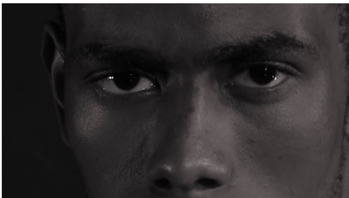
Figure 25: Mabuda. ( Missing , Scene 7). Photograph by Jaco van Wyk. 2017.

Iziengbe's digital text, filmed in black and white, supports her resolve to call upon and honour the seat of her strength - her sacral origins. The video footage, incorporating both medium- and close-up shots at two interchanging angles (from front and side) showing Iziengbe donning a headscarf, was intended to evoke a warrior-like impression - as if gathering her strength to go into to battle. The attentive and meticulous way in which she wraps and twists the headscarf (see Fig. 26) neatly into its place is reminiscent of the way in which she dressed herself at the beginning of the play before leaving her house for Johannesburg.