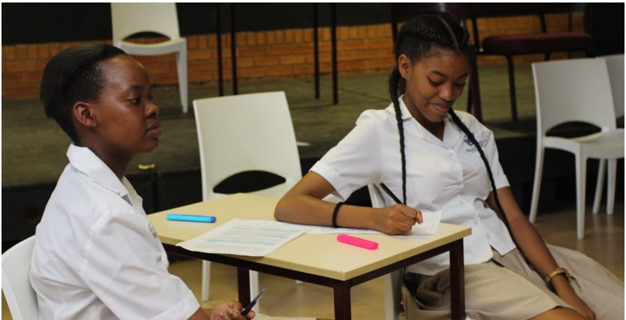
Figure 3: Actor-collaborators exploring possible character relationships.