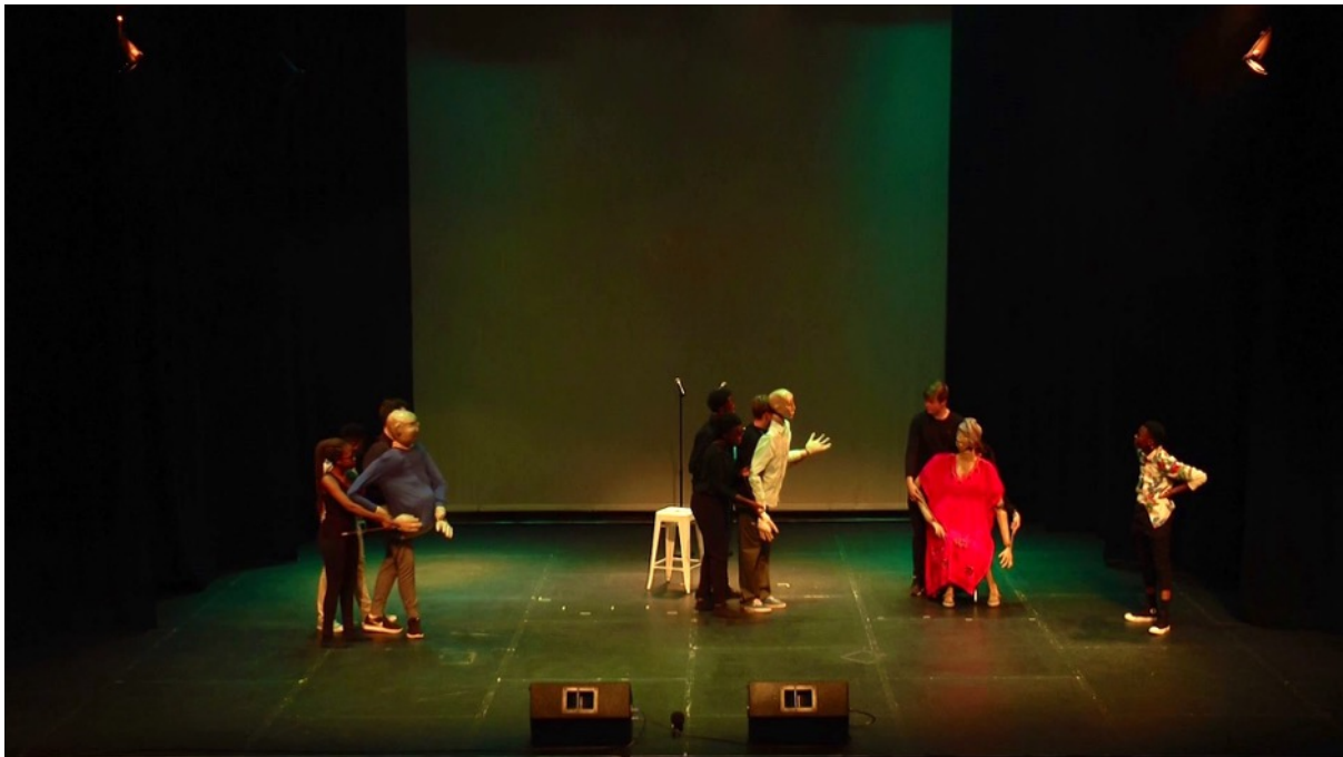
Figure 19: The Puppet Chorus ( Missing , Scene 5). Photograph by Jaco van Wyk. 2017.

comprised a great deal of experimentation and a ‘cornucopia’ of ‘DIY’ solutions. Puppet torsos, which were constructed from light wood, papier-mâché and bubble-wrap, also sported arms, hands and detachable heads (to facilitate mobility), whilst the puppeteers’ legs and feet, which were visibly part of the structural framework, completed the substructure’s anthropomorphic ‘gestalt’. The puppets, given their size and weight, in the end required the support of two puppeteers - while the first puppeteer navigated spatial demands, engineered head movements and held the frame in place, the second puppeteer regulated and maneuvered arm mobility and accompanying gestures.