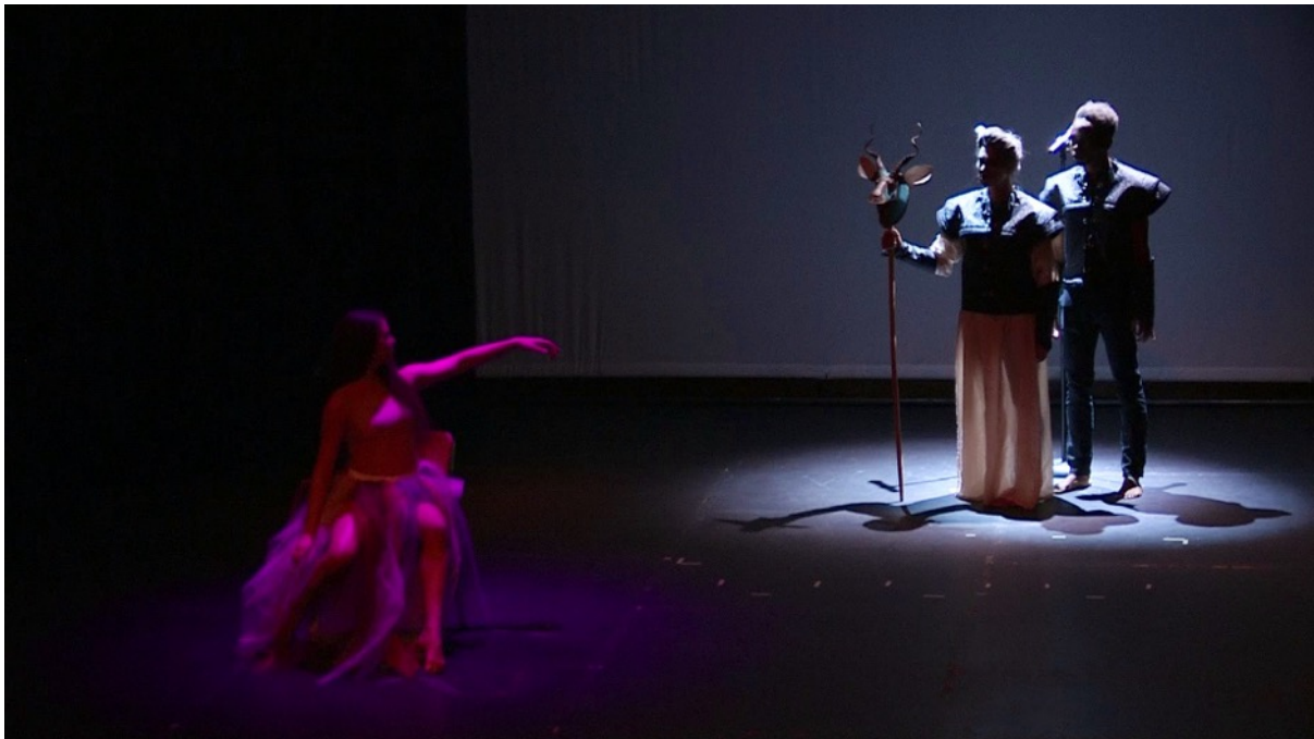
Figure 28: A dancing body performing the character of the bride. ( Missing , Scene 11). 2017.