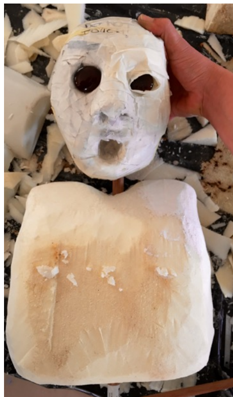
Figures 12 & 13: The first manifestation of our Puppet Chorus. Photographs by Jaco van Wyk. 2017.

art students, who also had no prior experience of puppet making, had to work extra hours on the construction of the puppets. Given the limited time available to the students for puppet-construction - both the visual art teacher and I taught full-time during the course of a school day - intermittent periods of 'stasis' occurred from time to time. Meanwhile, 'behind the scenes' in the rehearsal room, the cast and I had not yet finalised our conceptual narrative. Although cast discussions on characters had been underway, we were not able to provide the artist/puppet collaborators with 'newfound' insight on 'who' the personages that we were devising and 'working on' would turn out as - the successful outcome of our creative action often seemed to be balanced on a knife's edge. Aside from the text that had still not been finalised and with the puppets only in the first stages of construction, my burgeoning notions on music and the possible incorporation of video only acerbated my apprehension that our creative endeavour had become too expansive.