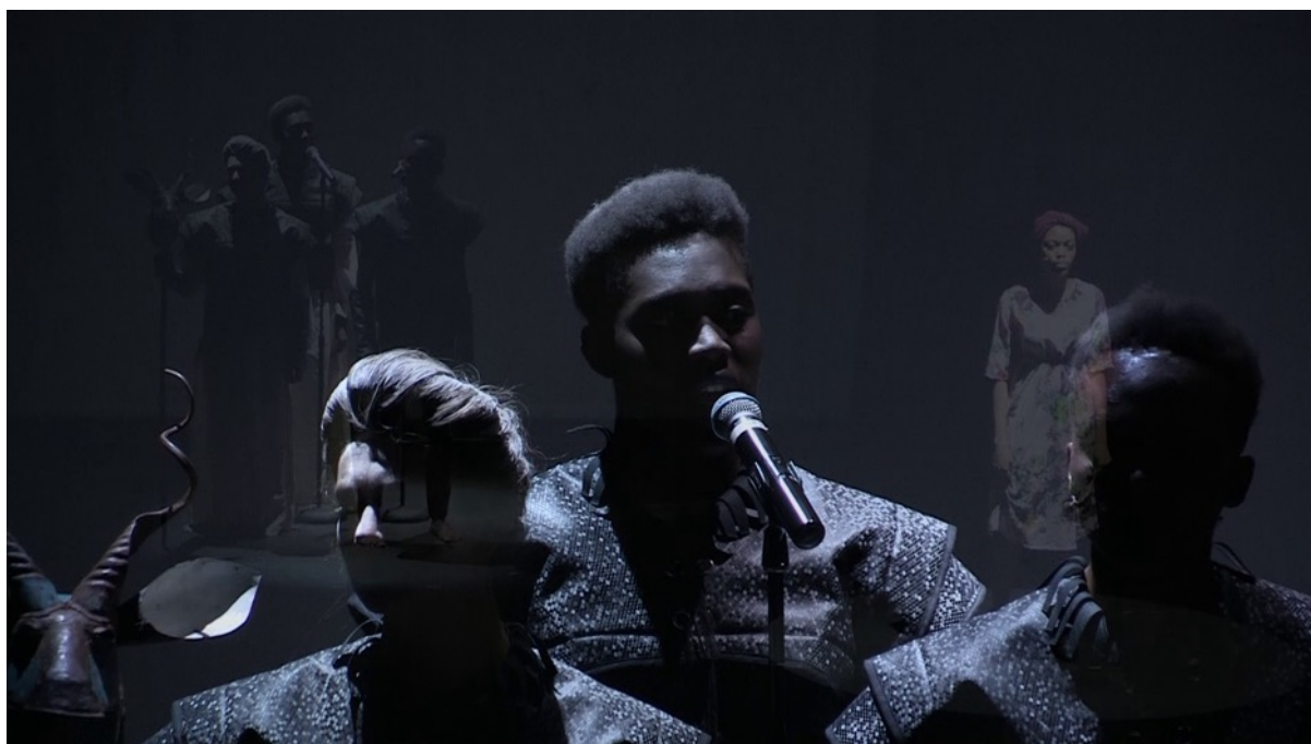
Figure 11: The Ghost Chorus. Photograph by Jaco van Wyk. 2017.

images - not in a filmic fashion as before, but images that could be staged inspired by ancient classical texts and Greek Mythology. In my mind's eye, 'the land of the dead' rose as an apocalyptic windswept and monochromatic wasteland from the depths of the river Styx 66 . Here, where the ferryman 67 bore the bodies of the dead, the familiar shadows of Hyenas, militiamen and the two African women, who had before so prominently featured in my conceptual landscape, reappeared. On stage, a four-member congregation of ghostly figures assembled on the riverbank.