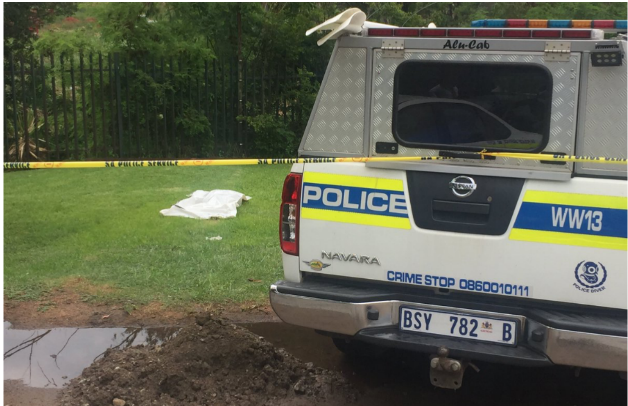
Figure 6: The recovered remains of Everlate Chauke.