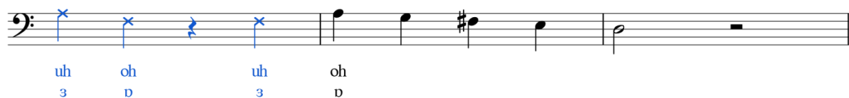
Figure 4: Phonation Exercise 4: Sound production through the use of healthy breath-flow (Jones, 2017, p.95)

Remind yourself that phonation is determined by your breathing and breath-flow (Jones, 2017).