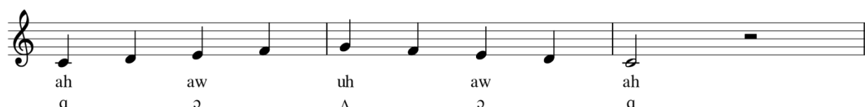
Figure 5: Phonation Exercise 5: Sound production through alternate vowel formation (Jones, 2017, p.95)

Sing a 5-tone scale using the two contrasting vowels (Jones, 2017).