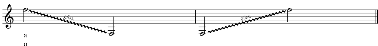
Figure 13: Mixing vocal registers 2: Bridging the passaggio (Leck, 2009, p.56)

Leck (2009) suggests this exercise which is like that of McKenzie's but that stretches over a greater distance and ascends again to the highest point of the falsetto. He believes that if this exercise is done without tension of the neck, jaw, or chin, most boys will find that, after time, the passaggi between the two registers would neither be felt nor heard (Leck, 2009).