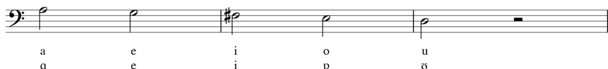
Figure 3: Phonation Exercise 3: Sound production through low and slow relaxed breath (Jones, 2017, p.95)

Add a 5-tone scale using these words and focus on the importance of a low and slow relaxed breath through your nostrils while lightly biting on the tongue (Jones, 2017).