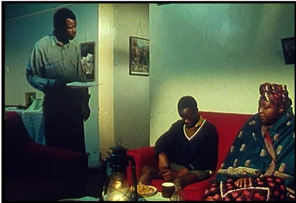
Image 7. An oppressive domestic space, husband shouts at his wife and son ( Battle )