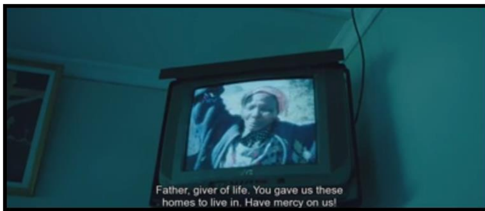
Image 27. Old woman weeps over the loss of her home, broadcast in the hospital scene ( Something Necessary )

The broadcast of the old woman crying over the loss of her home (Image 27) is overtly allegorical. This broadcast calls the viewers' attention to some of the problems that the nation is grappling with. For example, the positioning of the broadcast showing the old woman crying in the internally displaced peoples' camp at the point when Anne is struggling to wheel herself to her son's ward, signals to the viewer that the story is not simply Anne's story, but a national one. In this moment, Anne is situated in the national violence as she watches a television clip of what she represents. The old woman's story and Anne's story are linked to each other. Anne's story allows us to attend to precise details of the effect of the violence, while the older woman's story works as an exposition not only of her loss, but what this signifies when it is viewed as a national problem. This broadcast can be connected to the larger issue of displacement and land ownership. The message of the broadcast is buttressed by a comment by one of the characters in a scene at the commission who