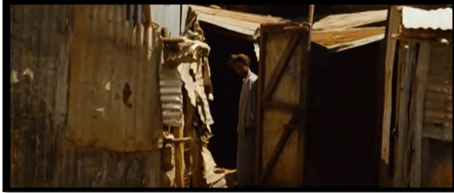
Image 21. Nyawawa looks at the camera momentarily before the closure of the film ( Soul Boy )