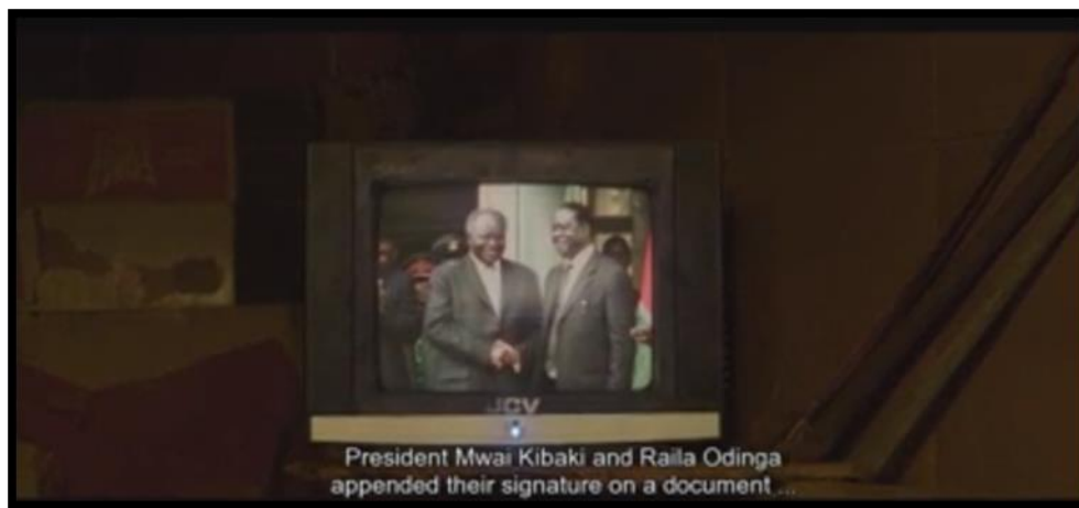
Image 28. President Mwai Kibaki and Raila Odinga handshake after peace accord ( Something Necessary )

The broadcasts and footage are also emblematic because they form pieces of history. As discussed in the previous chapter, emblems lend themselves to allegorical reading since they contain images that “mean more than they represent” (Daly 358). Thus, the audience can see beyond the telecast by connecting the images to broader social, economic and political concerns. Film scholar and critic Michelle Langford (2006) has described emblems as “scattered pieces of history” (126). Investigating the allegorical images in the cinema of German film director Werner Schroeter, Langford argues that by taking what fragments we can from a film, we can make meaning by connecting those fragments with our knowledge and history. Though united by their focus on the violence, each broadcast highlights not only a different aspect of the post-election violence, but also varied national histories connected to this violence.