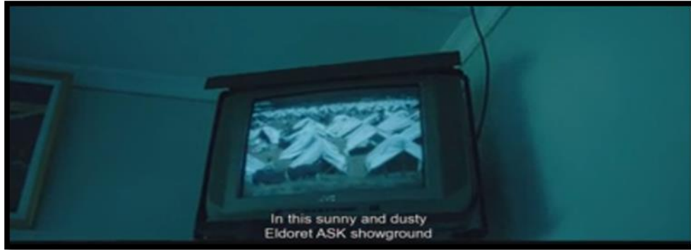
Image 26: Internally displaced people's camp ( Something Necessary )