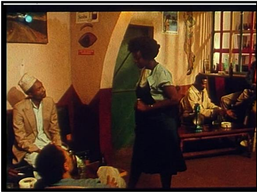
Image 9. Mumbi warns the men against supporting the action against the tree ( Battle )

This image of Mumbi in the bar authoritatively asking the men not to support the tree cutting project portrays a marked change in her personal growth. Compared to the image that opened this chapter in which she is still trying to fit in Githunguri, unsure of what her life in this setting would be, here we see her as one who has carved out a place for herself. In this image she draws the