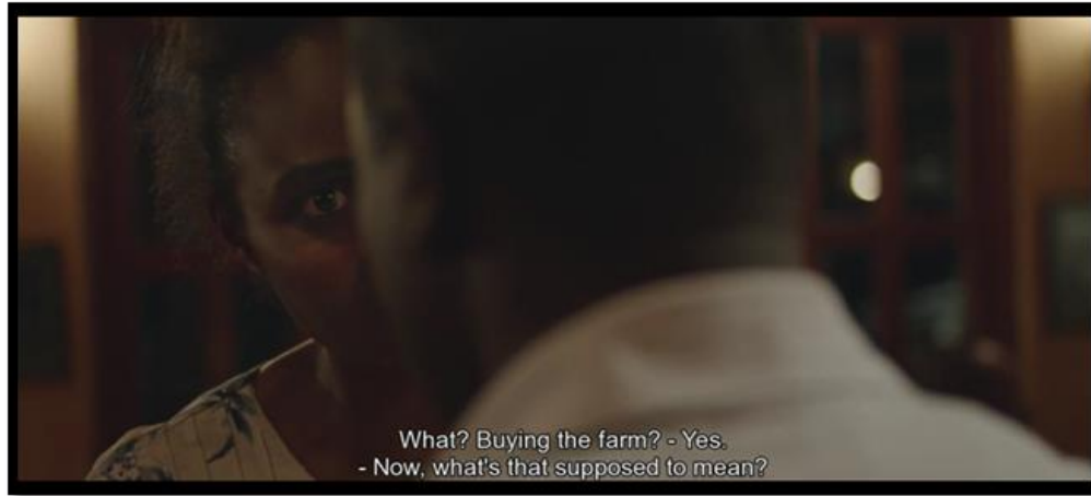
Image 38. Anne confronts Lesit on the land issue ( Something Necessary )

she did not belong to his community. Anne, then, embodies the doubly marginalised woman; first based on gender and secondly, due to her ethnicity.