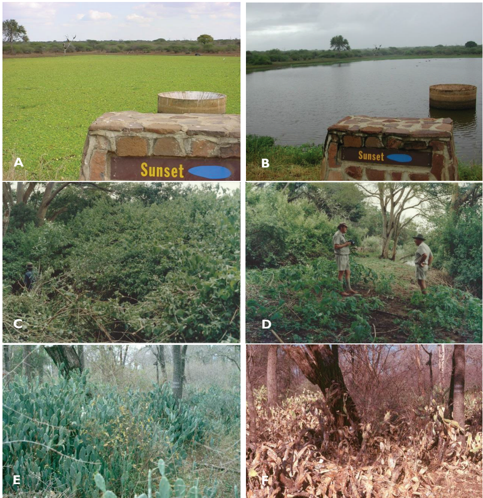
Figure 2. Before and after control of alien plant species in Kruger National Park, South Africa. Sunset Dam was heavily infested by Pistia stratiotes (A), which was effectively eliminated by a combination of biological and chemical control (B). Dense invasions of Lantana camara along the Sabie River (C) have required intensive mechanical and chemical control to clear (D). Populations of Opuntia stricta (E) have been effectively reduced to low numbers with biological control (F).

alien invasive plant densities by 80%. This study concluded that “Continuous clearing acts to effectively limit the establishment and spread of many invasive species despite the ever-present threat of invasion from upstream. Furthermore, the continuous clearing of invasive alien plant stands in KNP ensures that stands are relatively short-lived, preventing long lasting negative impacts on the ecosystem. Removal of invasive alien plant species reduces their disproportionate competitive influence and facilitates the natural re-establishment of native vegetation”. This study re-enforces the views of staff above that the densities of some species have decreased.