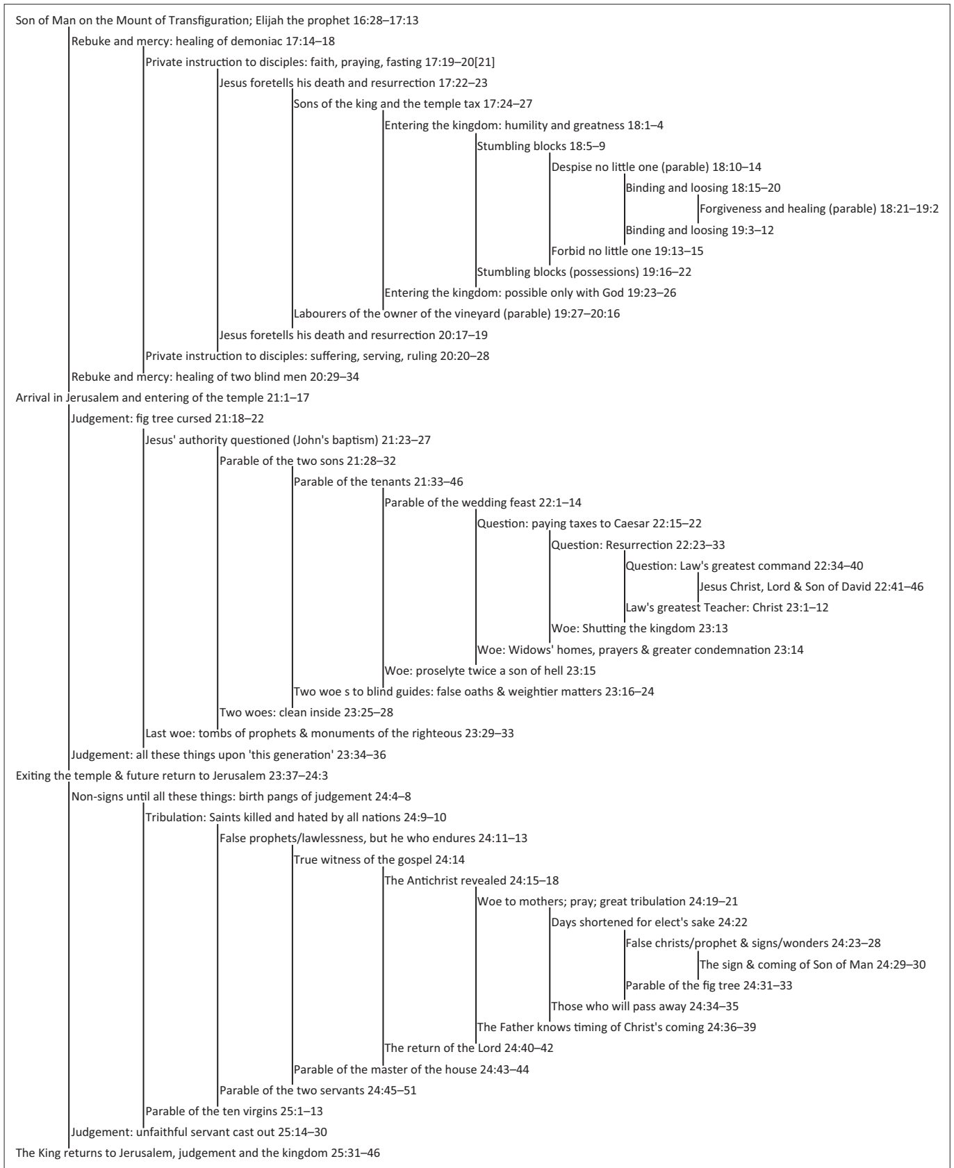
FIGURE 4: Chiastic structures in Matthew 16:28–25:46.

found in the Hebrew Scriptures. Prior to the inspiration of the first New Testament documents, the teaching of the apostles must have been orally, but if taught by using parallelisms, known to those original listeners, it would