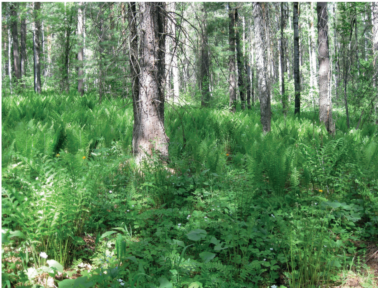
Figure 1: Nemoral coniferous forest of the Milio-Abietion ( Abietetalia sibiricae , Asaro europaei-Abietetea sibiricae ) in the Western Sayan Mts., Southern Siberia.

The Asaro europaei-Abietetea sibiricae have a disjunctive distribution range occupying the Southern Ural