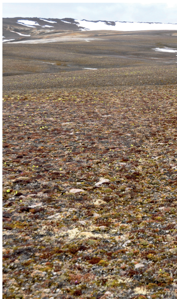
Figure 3: Tundra-like polar desert cushion forb-lichen-moss vegetation near Krenkel Station at 80°38' N on Hayes Island, Franz Josef Land, Russian Federation. Photo: D.A. (Skip) Walker, August 2010.

Slika 2: Splošni izgled vegetacije razreda Drabo-Papaveretea z vrstami Micranthes foliolosa , Papaver dablianum (rumene pike), Saxifraga oppositifolia , S. cespitosa , mahovi in lišaji. Isachsen, otok Ellef Ringnes Island, Nunavut, Kanada na permafrostu z značilnostmi strukturiranih talnih oblik (nerazvrščeni krogi) na rahlo nagnjeni podlagi. Foto: F.J.A. Daniëls, julij 2005.