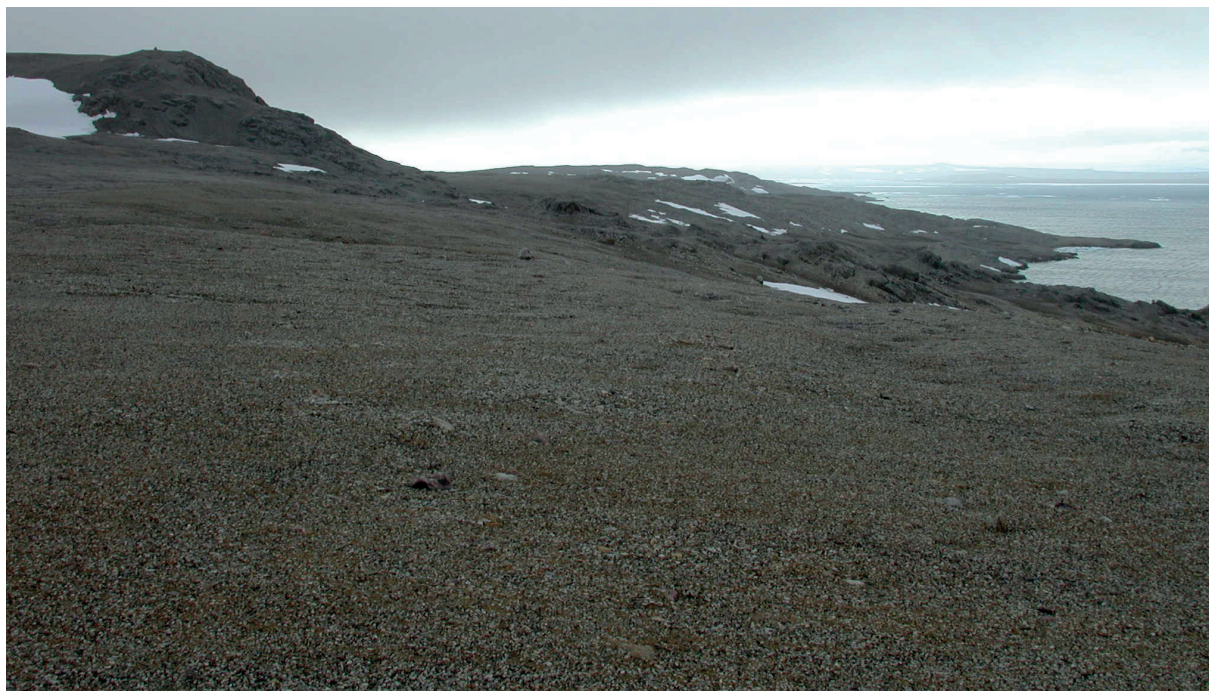
Figure 1: Polar desert vegetation and landscape at Kinnvika, Nordaustlandet, Svalbard, 80° N. The limestone landscape appears to be sterile, but ca. 20 vascular plant species are regularly scattered over the area. Photo: A. Elvebakk, July 2005.

The Subzone A is botanically characterised by occurrence of only 100–120 vascular plants species (Elven et al. 2014, Daniëls et al. 2013). Around 100 species of vascular plants occur in the Russian Arctic polar desert (cf. Aleksandrova 1988, Chernov et al. 2011, Matveyeva & Zanolka 2015). Twenty-five species, or about 20% of the total Subzone A flora, occur all around the polar desert subzone A with more than 80% frequency. These taxa include Alopecurus borealis , Cardamine bellidifolia , Cerastium arcticum , C. regelii , Cochlearia groenlandica , Draba corymbosa , D. micropetala , D. pauciflora , D. subcapitata , Luzula confusa , L. nivalis , Micranthes nivalis , Papaver dahlianum , Phippsia algida , Poa abbreviata , P. arctica , Poa pratensis subsp. alpigena , Potentilla hyperarctica , Puccinellia angustata , Ranunculus sulphureus , Saxifraga cernua , S. cespitosa , S. hyperborea , S. oppositifolia and Stellaria longipes s.l.). In local floras of the Subzone A the species count of vascular plants is about 50. They are not abundant and occur scattered, usually as single specimens.